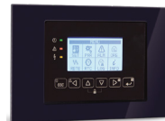
Latest generation control panel

The precision air conditioners in the G Series have build and operating features that meet latest generation Data Center design criteria.